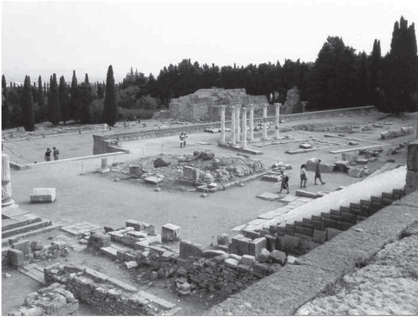
Fig 3. View from the upper terrace down to the middle and first terrace of the Asclepieion of Cos.