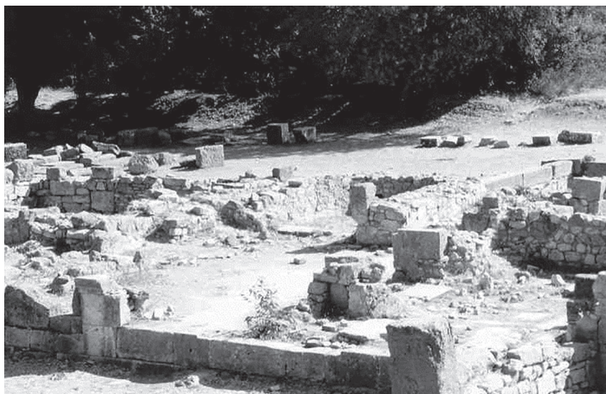
Fig 4. Archaeological remains of houses in the entry area of the Asclepieion of Cos.

Today, the remains of a Christian altar can be seen here. This testifies to the further development of this sanctuary. This upper temple was subordinated in its cultic function to the Asclepius temple with the altar, located on the middle terrace.