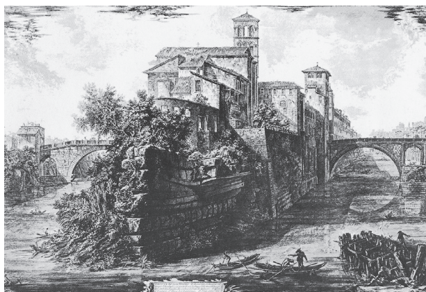
Fig 5. Copper engraving of the Tiber Island. Giovanni Battista Piranesi: Vedute di Roma , circa 1780. Photo: under Creative Commons License by Wellcome Collection and depicted in Steger 2018: 73 fig. 10.

If this is done properly, Aristides is also a source for insights into the religious environment of Asclepius in his well-known prose hymns (for example Aristid. Or. 38, 39, 42, 53, Russell et al. 2016). Hymn 39 is almost a declaration of love to the well in the Asclepieion (Aristid. Or. 39.1). This praise is quite transfigured, and no significant knowledge about medical practice can be gained from the hymn. Perhaps, however, one should emphasize the importance of water (Aristid. Or. 39.12), which is indeed in a ritual sense as well as in a healing sense central to the cult and medicine of Asclepius (Aristid. Or. 39.15):