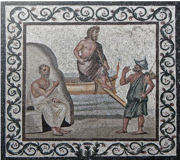
Fig 2. The arrival of Asclepius on Cos. Mosaic from the House of Asclepius, Cos, Archaeological Museum of Cos, height 1.13 m, width 1.11 m, 2nd or 3rd century CE, depicted in Petsalis-Diomidis 2010: fig. I.

In general, it should be noted that for the presentation of the history of sanctuaries of Asclepius in relation to culture and medicine, epigraphic sources, literary texts, papyri, numismatic and archaeological evidence need to be considered.