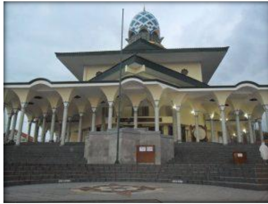
Figure 1. The Great Mosque of Kediri City